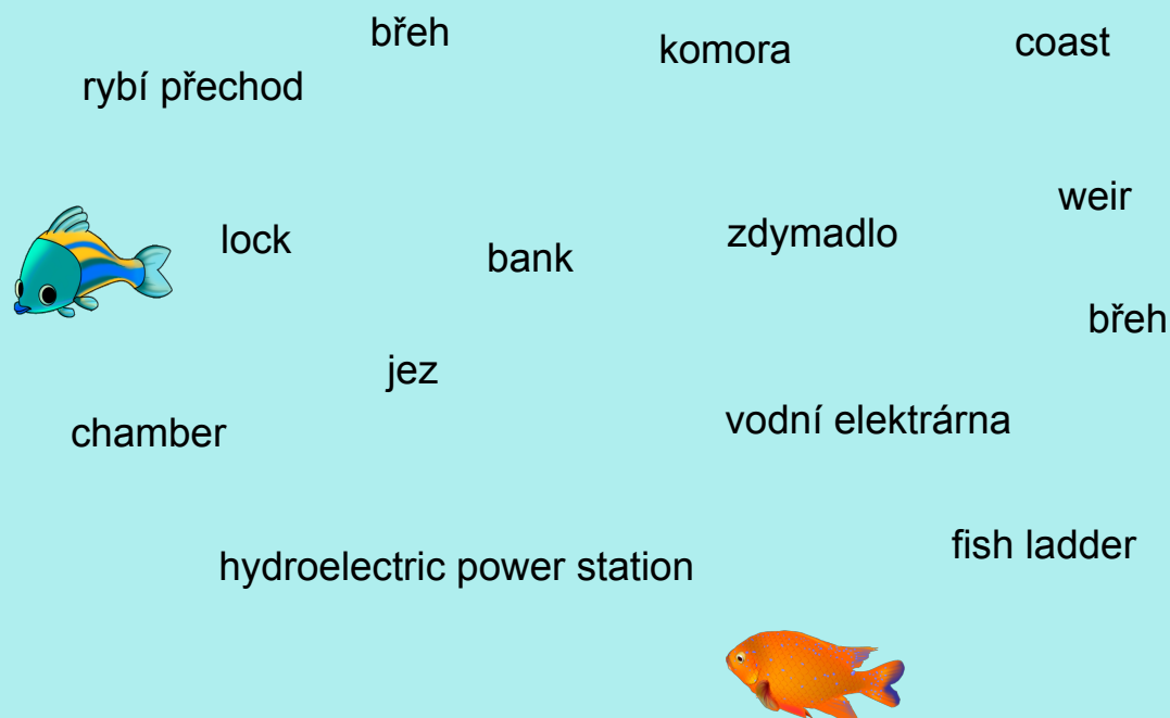
Lock - vocabulary